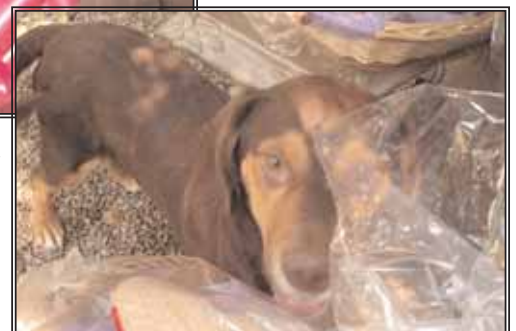
(right) T.J. checking out the goodies