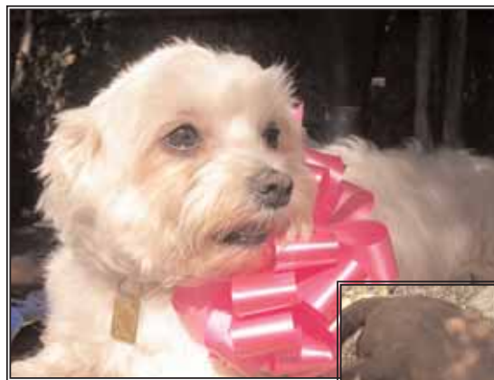
(left) Rocky sporting a bow from one of the gift baskets.