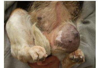
May's bladder hernia